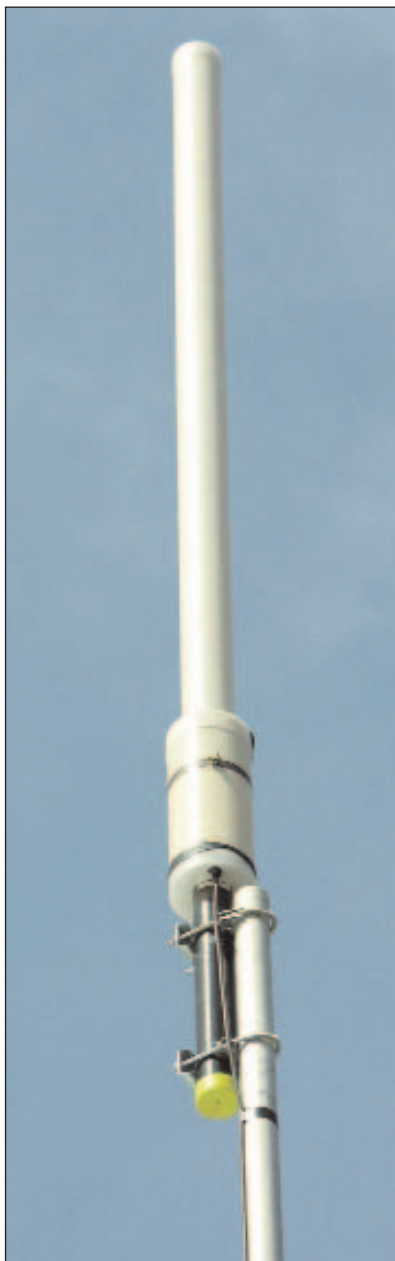
An alternative method of mounting the E-H antennas: directly on to a 1.5in dia pole.

Where I did have some difficulties was in experiencing some sort of flashover at higher power levels,